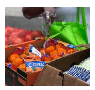
1,269,292 pounds of the food distributed by the FRFB network were fresh fruits and vegetables